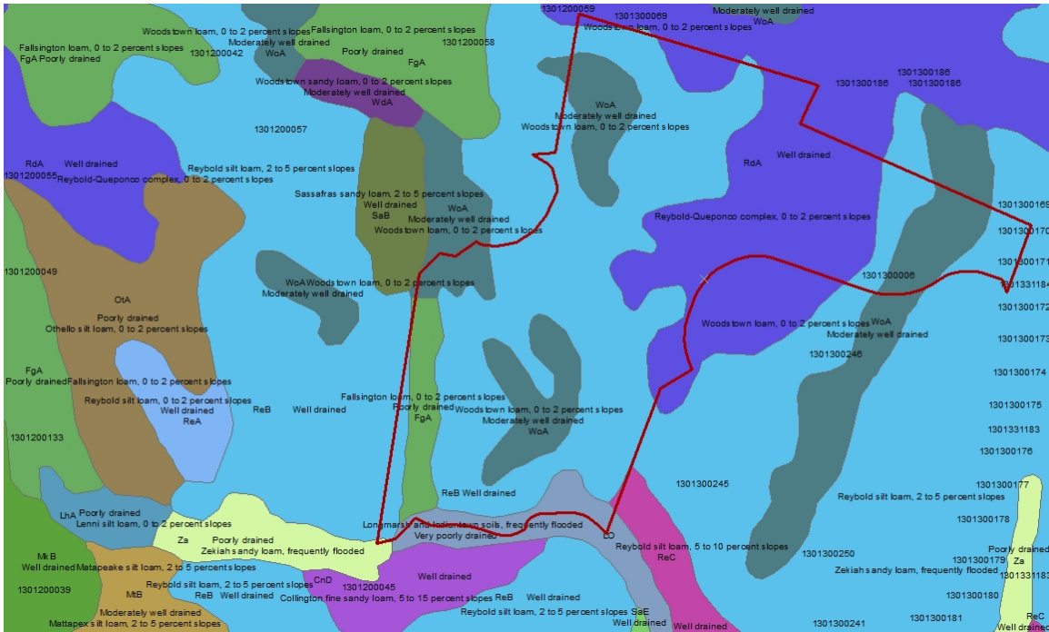
Figure 1: NRCS soil mapping in the vicinity of the proposed project.